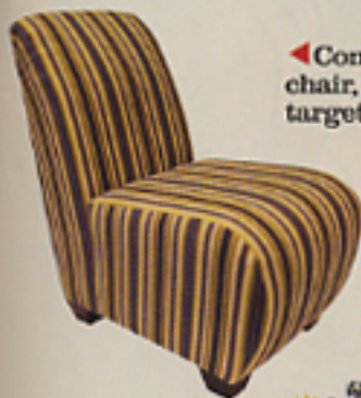
◀ Contemporary chair, $200, target.com