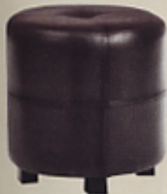
◀ Double-stitch chocolate-brown leather ottoman, $50, target.com