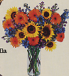
▶ Val D'Arno sunflower bouquet, $82, calyxandcorolla.com