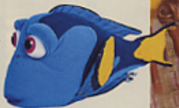
▶ "Dory" from Finding Nemo stuffed toy, $7, amazon.com